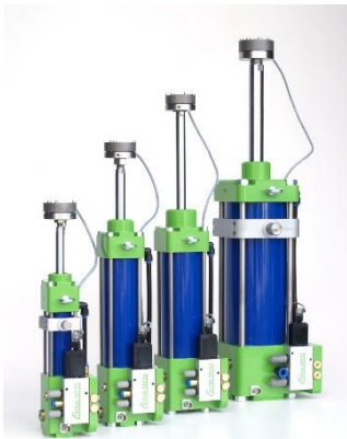
Type SPIAx/P LCF