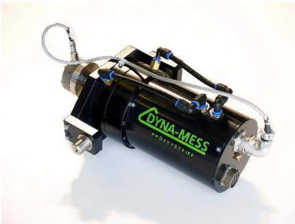
Type SPIAx/P HF

with digital controller DYNA-CLC and testing software DYNA-TCC