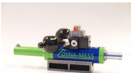
Type SPIAx/H HCF