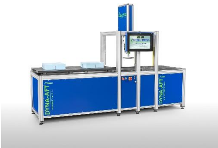
DYNA AFT - Automated foam tester