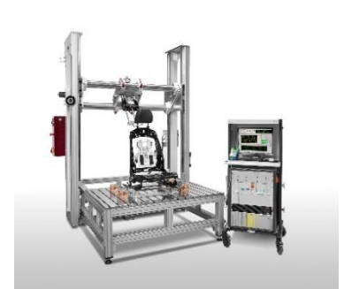
Single-axis seat testing