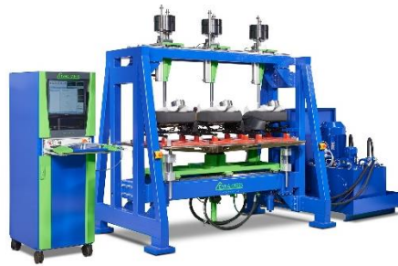
DYNA-EVP - Road signal simulator