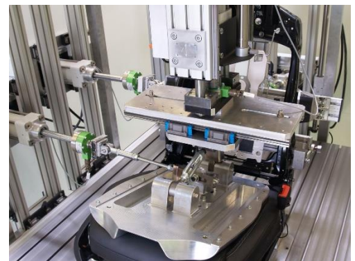
Multi-axis seat testing