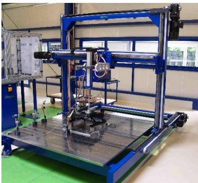
Frame for stiffness and clearance