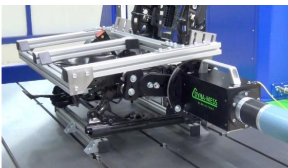
DYNA-SHV - Height adjustment tester