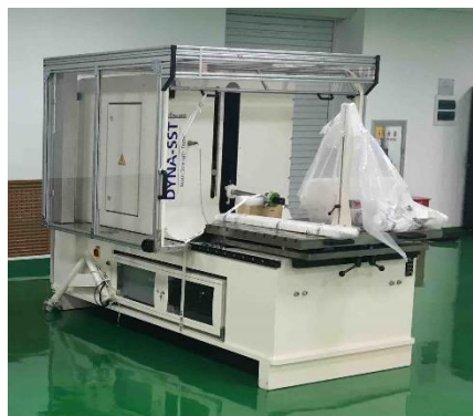
DYNA-SST - Static strength tester for recliner