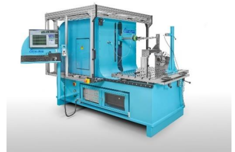
DYNA-FTT - Fast tension tester for recliners